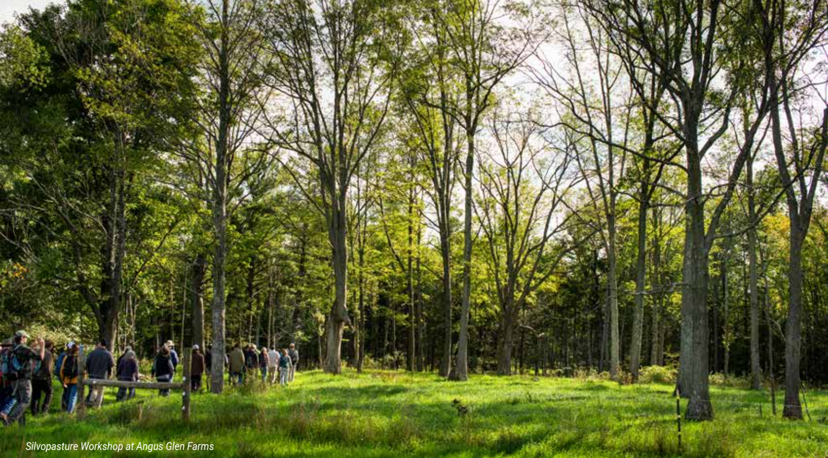
Silvopasture Workshop at Angus Glen Farms