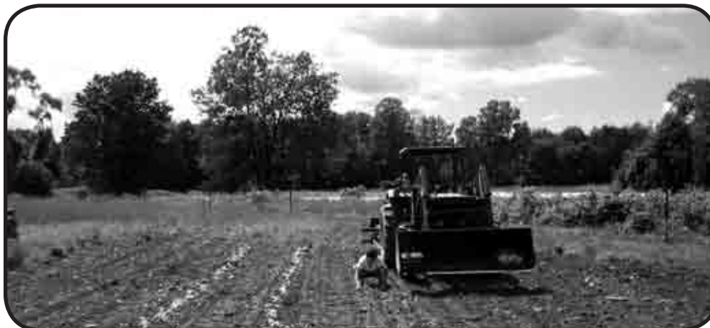
Planting Brussels sprouts at Stick & Stone Farm